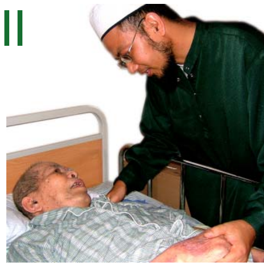
A father's unconditional love is reciprocated when his child loves him back.