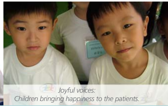
Joyful voices: Children bringing happiness to the patients.