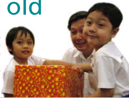
It is a blessing to give: Presenting the hong baos and mandarin oranges to St Luke's Hospital.

About 160 children, aged four to six, from Pasir Ris Bethesda Kindergarten visited elderly patients at St Luke's Hospital during Chinese New Year. The children sang, danced, gave mandarin oranges and spread cheer to patients. While singing, the children walked around and shook the patients' hands. The children also donated their hong baos to the hospital's Patient Welfare Fund, which is used to help the needy patients.