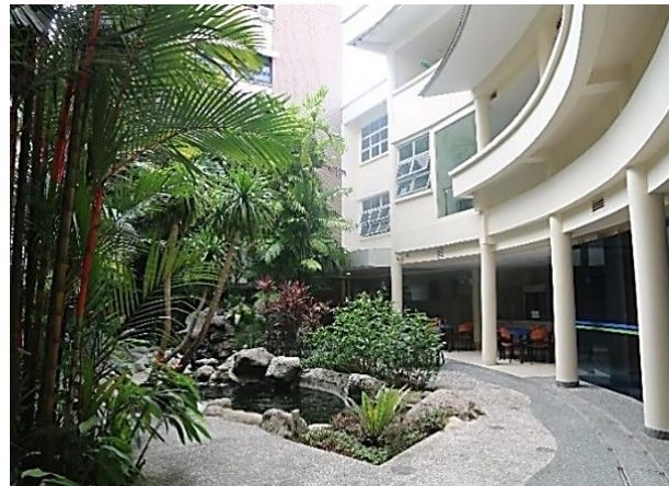
St Luke's Community Clinic is a one-stop clinic with a wide range of services.

We aim to holistically manage not just the clinical, but also the psychological, social and spiritual needs of our patients.