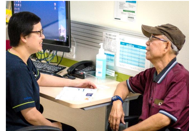
St Luke's Community Clinic coordinates care of multiple medical conditions.