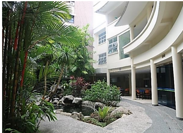
St Luke's Community Clinic is a one-stop clinic with a wide range of services.

We aim to holistically manage not just the clinical, but also the psychological, social and spiritual needs of our patients.