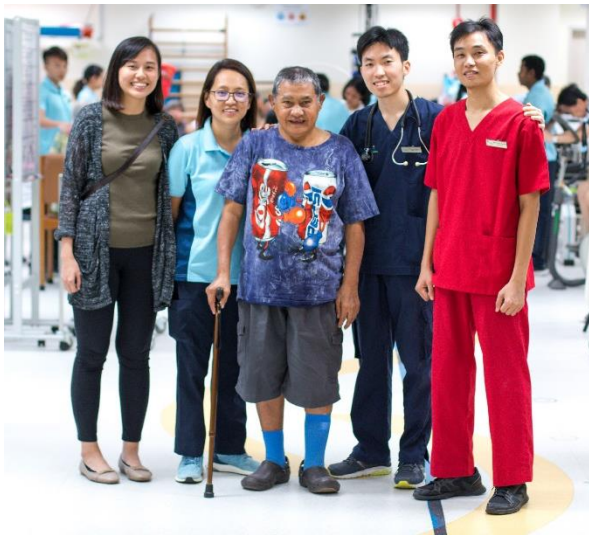
Our multi-disciplinary team provides holistic care.

Cases requiring further investigations and treatment will be referred to NUH.