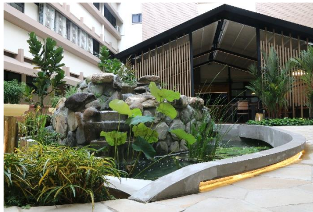
St Luke's Community Clinic is a one-stop clinic with a wide range of services.

We aim to holistically manage not just the clinical, but also the psychological, social and spiritual needs of our patients.