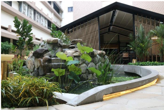
Posed photos of patients and clients are for illustration only.

Referral and enquiries: call 6895 3216 or email referral@stluke.org.sg