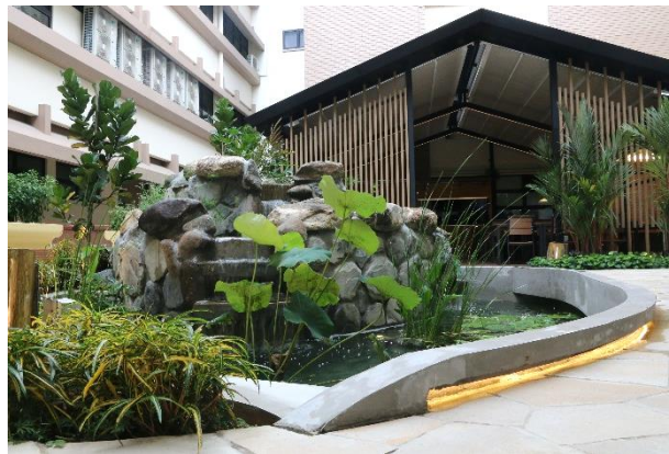
St Luke's Community Clinic is a one-stop clinic with a wide range of services.

We aim to holistically manage not just the clinical, but also the psychological, social and spiritual needs of our patients.