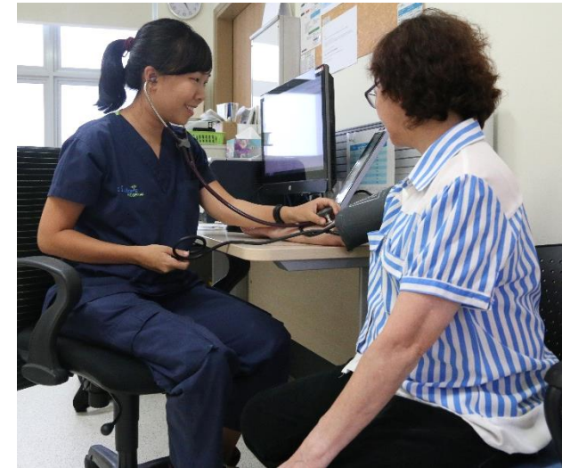
St Luke's Community Clinic coordinates care of multiple medical conditions.